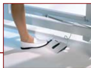
125.062 Electric footswitch