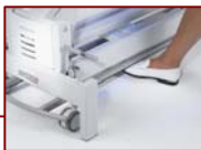
125.061 Electric Gymna peripheral switch