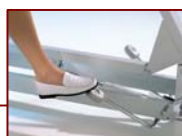
125.063 Hydraulic foot pump