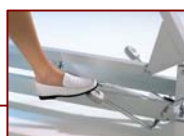
125.033 Hydraulic foot pump