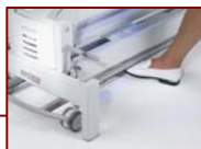
125.031 Electric Gymna peripheral switch