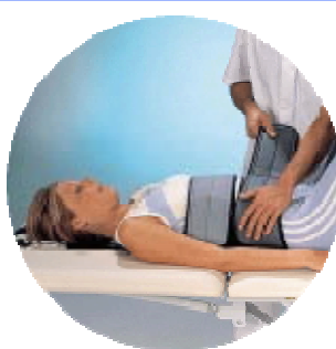
100 476 + 100477