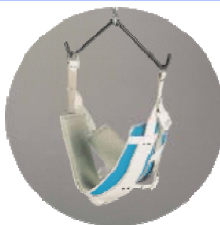
100 457 + 100 458 + 100 459