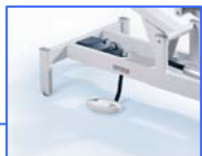
126 112 Electrical footswitch