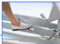
126 113 Hydraulic foot pump