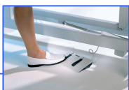
125 082 Electric foot switch