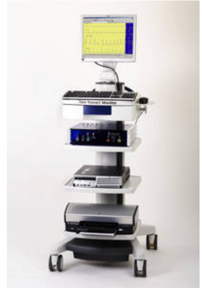
Task Force® Monitor